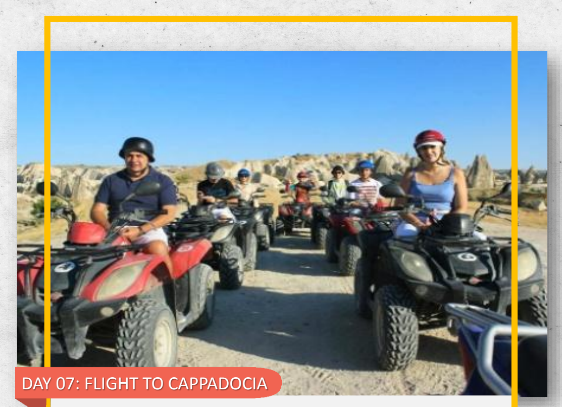
After breakfast, flight to Cappadocia. On Arrival, Transfer to Hotel, Check in. Evening Sunset ATV Ride for 2 hours. Dinner at Indian Restaurant . (Breakfast & Dinner)